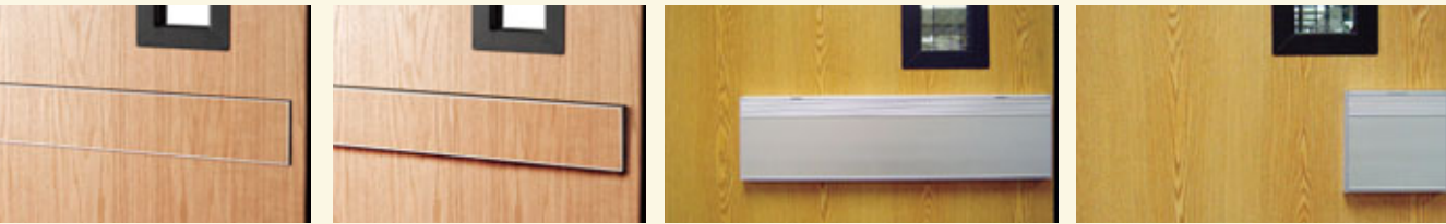
From left to right: Flush Panic in open position, Flush Panic in closed position, standard exit device, and SPI4 exit device.